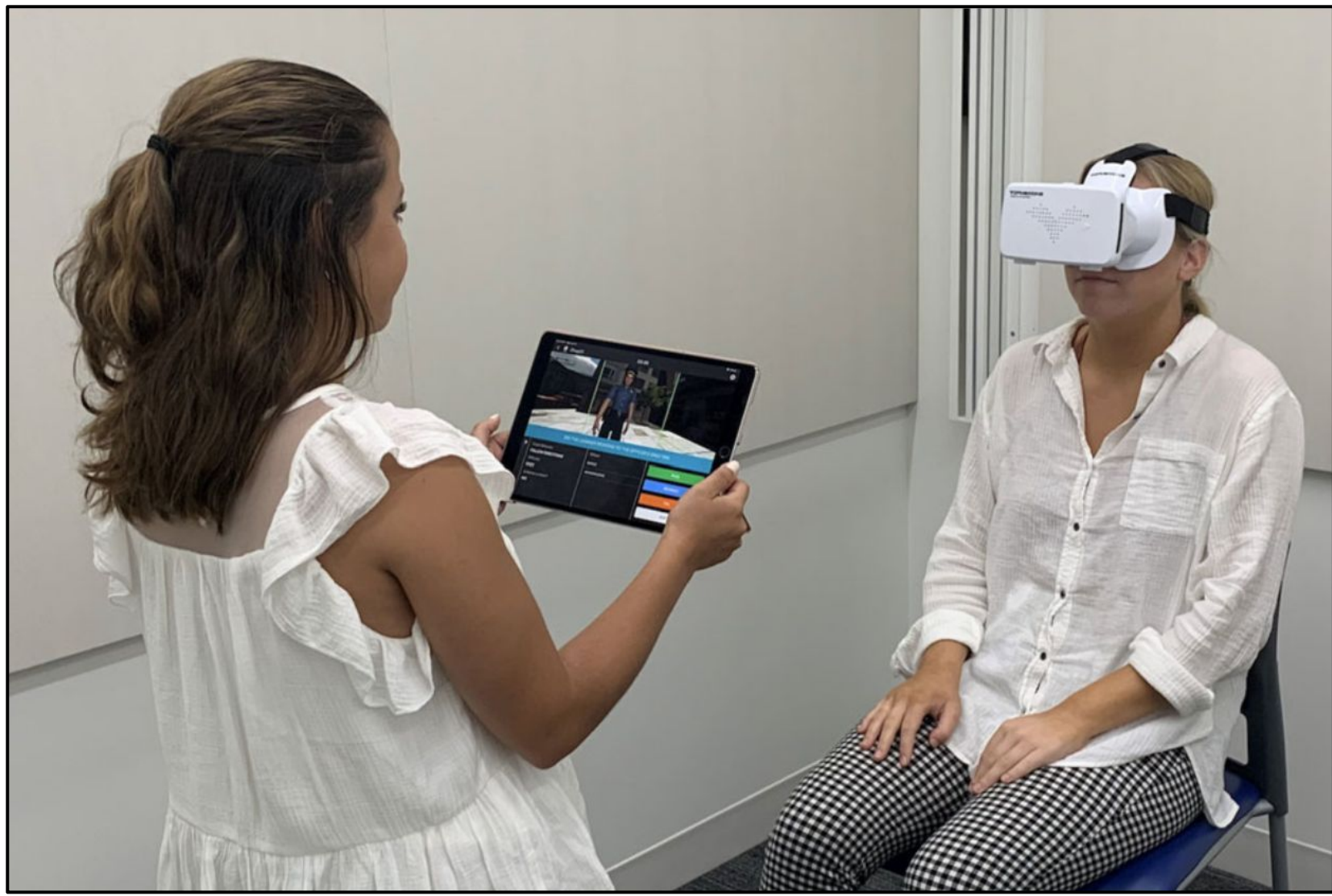
Figure 2. A Floreo session consists of a learner and a coach. The coach (often a therapist, teacher, parent, etc.) uses an iPad to see the learner's visual field and to help the learner progress through the lesson using system-provided coach buttons in the dashboard. This allows the coach to monitor the learner's attention to the virtual environment and give appropriate feedback at pivotal times during the lesson.